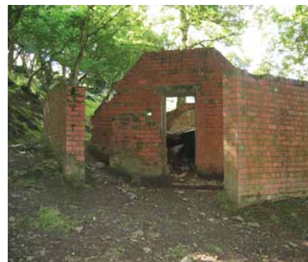
Remains of a WWII aeroplane decoy centre Olion canolfan denu awyrennau o'r Ail Ryfel Byd

5. Turn R on lane and continue ahead passing Alyn Kennels on R. Thro' KG behind kennels and follow path back into Loggerheads Country Park. Ignore footbridge on R and continue along path with river on R. Cross over stone bridge and walk back to Countryside Centre and car park.